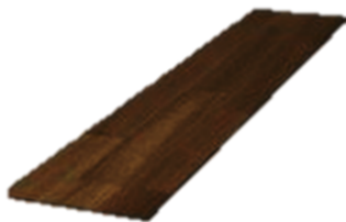
Wear layer Hardwood

Veneer bottom layer ensures dimensional stability