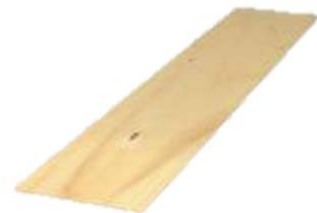
Bottom layer Veneer