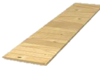
Middle layer Softwood